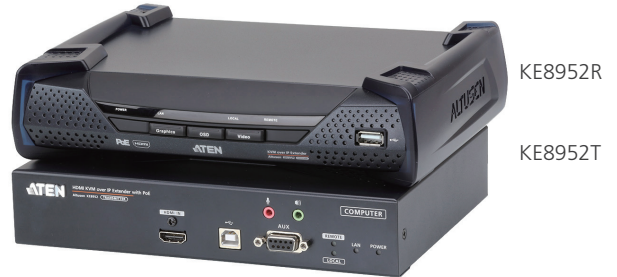
KE8952R / KE8952T Front View