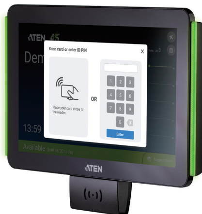
VK430 + VK401