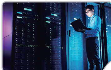
Data Centers / Server Rooms